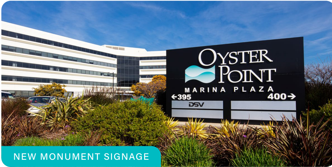
NEW MONUMENT SIGNAGE