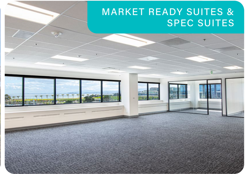
MARKET READY SUITES & SPEC SUITES