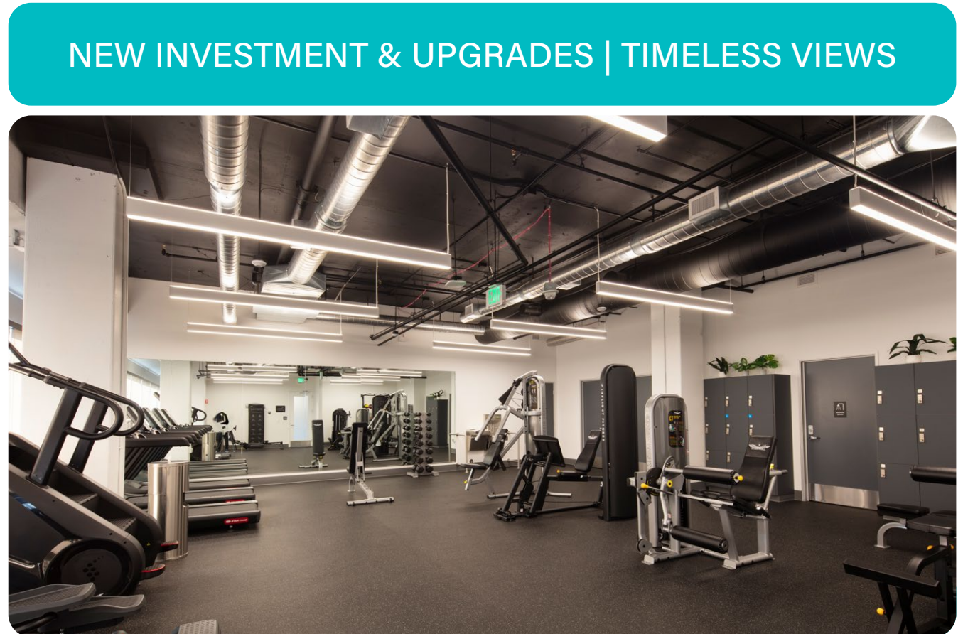
NEW INVESTMENT & UPGRADES | TIMELESS VIEWS