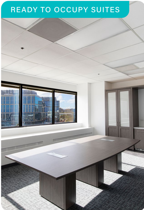
READY TO OCCUPY SUITES