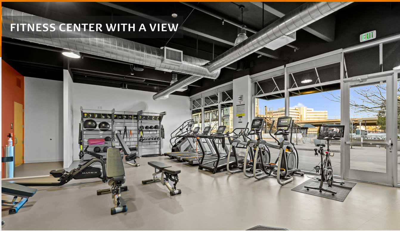
FITNESS CENTER WITH A VIEW