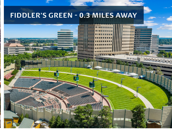
FIDDLER'S GREEN - 0.3 MILES AWAY