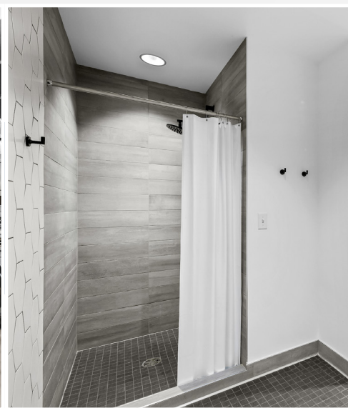
EXECUTIVE SHOWERS & LOCKERS