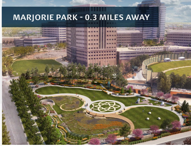
MARJORIE PARK - 0.3 MILES AWAY